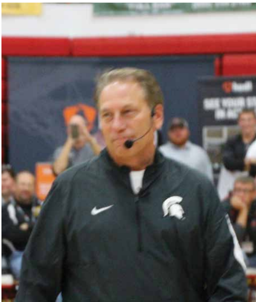
Tom Izzo speaking at WBCA Fall Clinic