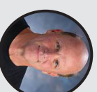
VANCE WALBERG “Godfather of Dribble Drive Offense”